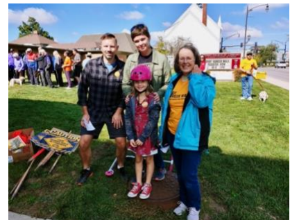
CROP Hunger Walk 2022

After seven incredible years, we again reached out to serve our community through “Love Your Neighbor Day.” We collaborated with more congregations as this grows as a community day of service assisting those financially and/or physically unable to complete work at their homes. Many congregations and members of the community participated with us as more than 140 volunteers cleaned, cleared debris, painted, and helped 34 families in our community.