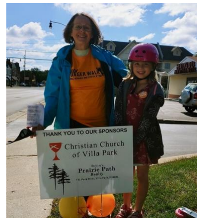
CROP Walk Sponsor 2022

The ministries we already have are places we will start, but, we are also exploring new relationships with community organizations that will allow us to be more effective in addressing the various needs in our community. We remain committed to alleviating hunger and also look to ways we can address underlying issues of food insecurity. We remain committed to helping homeowners who are struggling to maintain their properties and also look to the underlying issues that lead to struggles with housing.