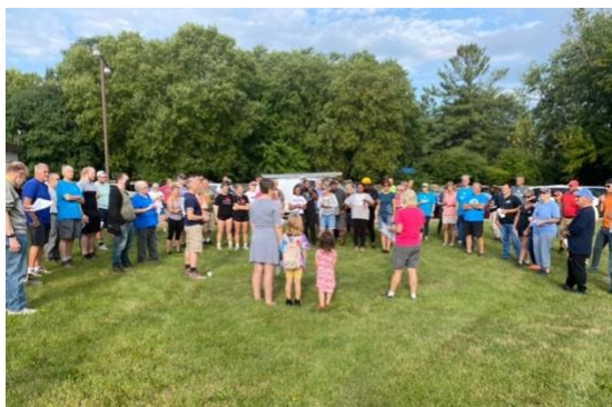
The morning of Love Your Neighbor Day 2022